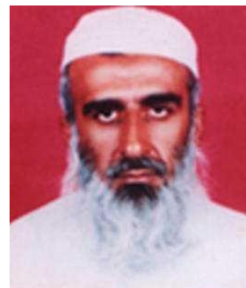
Molavi Ahmad Sayyad, found dead after being arrested by Iranian security forces in 1997

In April 2006, the Rasoul-e Akram military base was set up in Zahedan, intended to co-ordinate the efforts of police, military and other security agencies in the area, following the