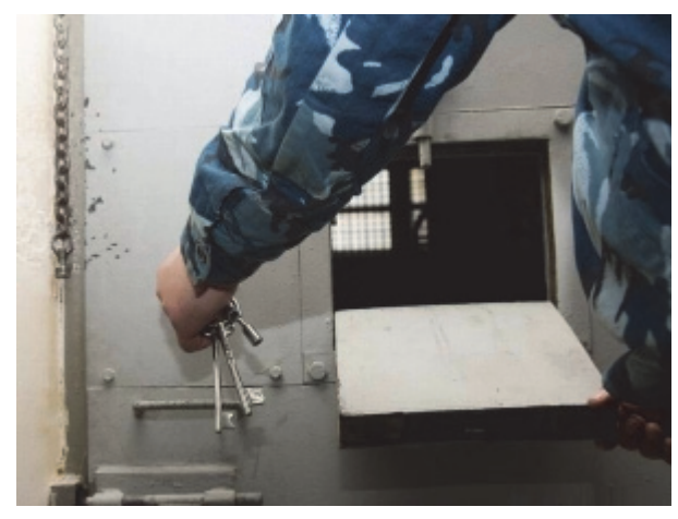
A guard in a solitary confinement block at an unidentified prison in Uzbekistan. Prisoners in solitary confinement in Uzbekistan's prisons experience cramped cells without bedding—some in total darkness, others with permanent bright lights.

International standards state that "punishment by placing [the prisoner] in a dark cell, and all cruel, inhuman or degrading punishments shall be completely prohibited."<sup>364</sup> Experts have concluded that prolonged