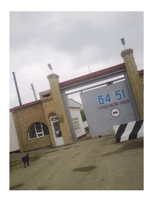
Kasan prison colony 64/51 in the southern province of Kashkadarya. In 2013 the International Committee of the Red Cross announced it would stop monitoring places of detention in Uzbekistan, citing authorities' interference with its standard working procedures.

The UN Human Rights Council has a clear mandate to "address situations of violations of human rights, including gross and systematic violations and make recommendations thereon." The Uzbek government's systematic failure to engage meaningfully with human rights mechanisms—as demonstrated by its longstanding denial of access to special