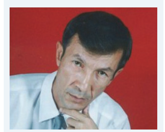
Born: April 29, 1962 Arrested: February 22, 2009 Charges: Extortion and counterfeiting documents Sentenced: July 30, 2009; 12.5 years