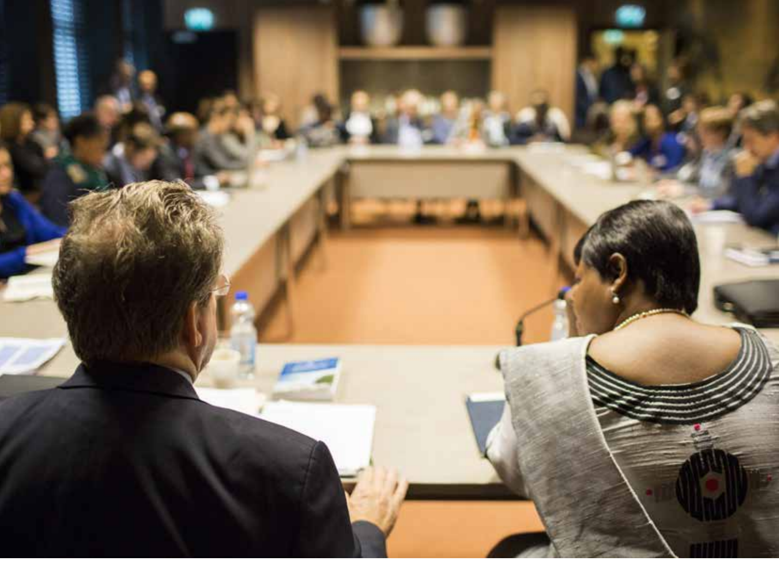
Meeting between NGOs and the ICC Prosecutor and her team, 14th session of the Assembly of States Parties, The Hague, November 2015.