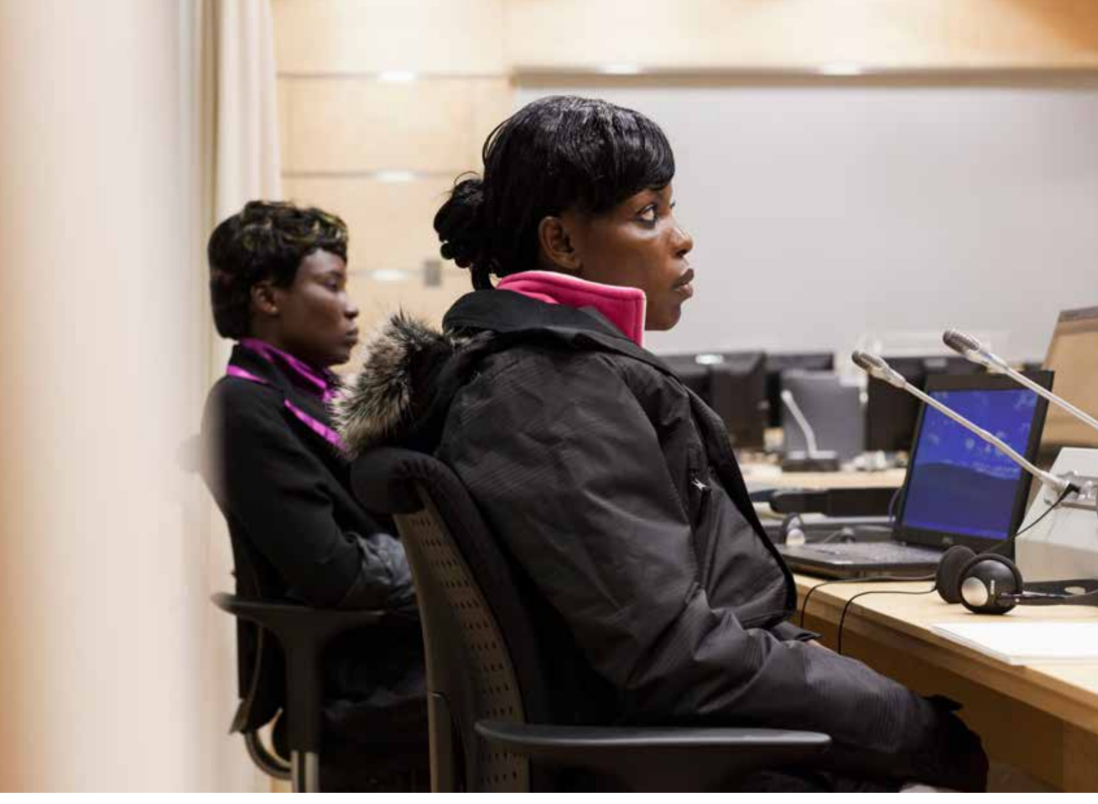
Victim participating in the Bemba Trial appearing before the ICC without protection measures. The Bemba Case (Central African Republic).